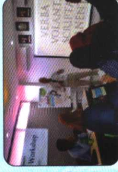
Excellent Writing Club July 2019 - Surabaya

The university should send the documents to Van Deventer-Maas Indonesia Office in Yogyakarta to be selected in compliant with the above requirements. The agreement will be provided between the foundation and the university partners as well as between university partners and students to be signed upon approval.