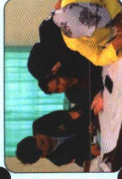
Citizenship Workshop "To Build an Active Citizens for a Sustainable Social Development" September 2019 - Trawas