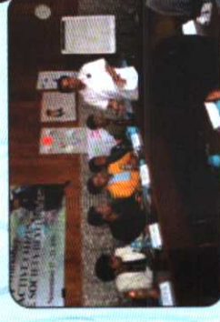
Citizenship Workshop "To Build an Active Citizens for a Sustainable Social Development" November 2019 - Semarang