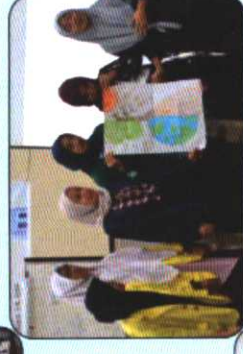
Regional Meeting 2 Padang State University Februari 2020 - Padang