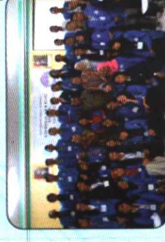
Regional Meeting 1 Patimura University Maret 2020 - Ambon

For further information about VDMI: http://www.vandeventermaas.or.id